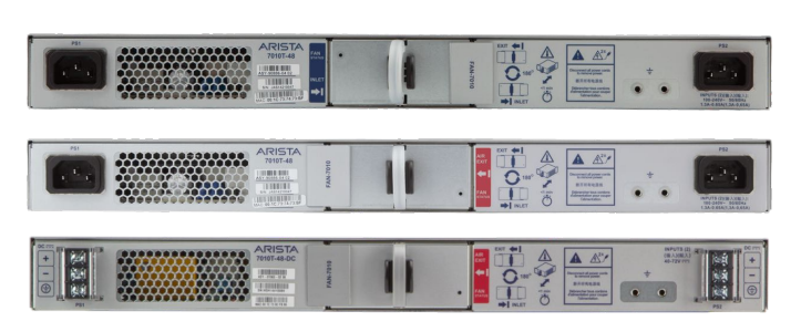
Arista 7010T Rear View - reversible airflow, AC & DC